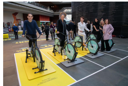
Seat at the Table: Kimmel Cultural Campus

And while at the Kimmel Cultural Campus, don't miss your LAST CHANCE to see "Seat at the Table"! This exhibition honors the women of yesterday and today who have furthered the cause of gender equity in order to give women an equal voice in every sphere.